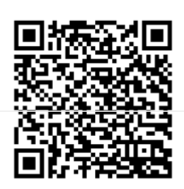
Link to this section

The soldering irons get very hot, do not touch the non-protected parts of the iron. Touching the non-protected parts of the soldering iron can result in 2nd to 3rd degree burns. If you need to change the tip, check if the iron has cooled down, by using the IR-temperature measurement pistol (safest) or by shortly putting it on the damp sponge (not safe). If you have swapped the tip, please, after use, let it cool down and put the original tip back. (fine tip on the left station, small chiseled tip on the right station)